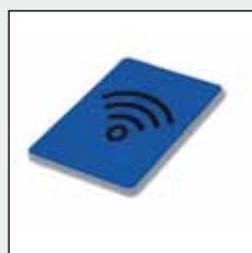
Long lasting staff keycards: Cards may be customized at your request.