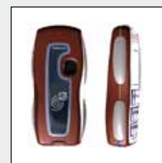
Cell phone: Compatible with NFC technology cell phones.