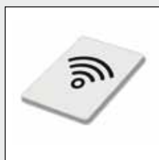
Low cost guest keycards: Cards may be customized at your request.