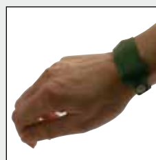
Wristbands: The ideal RFID carrier for 'allinclusive' resorts and spas.